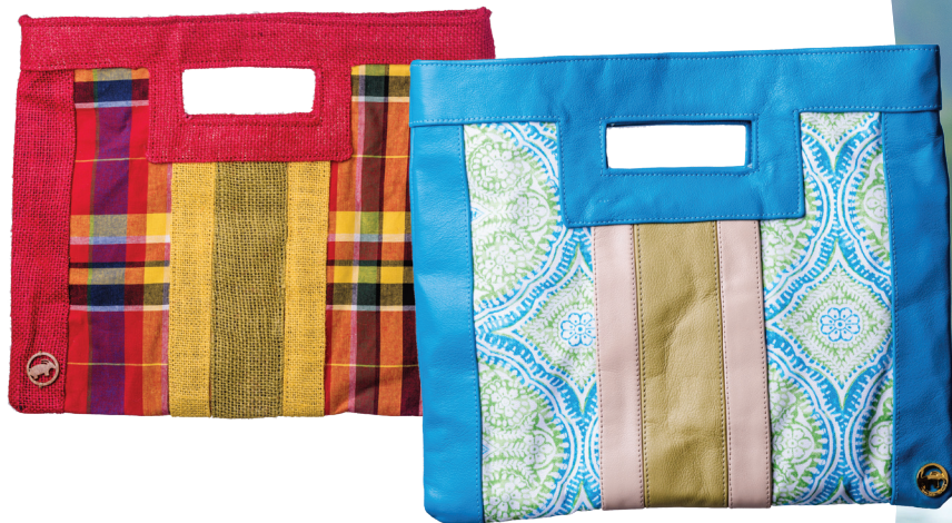
BURLAP JASMINE US$55.00

An oversized clutch that holds all your essentials while allowing you to remain stylish. Dimensions: 12.5" x 15" Cotton lining Closes with a magnetic snap.